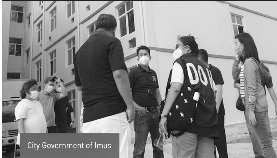
City Government of Imus