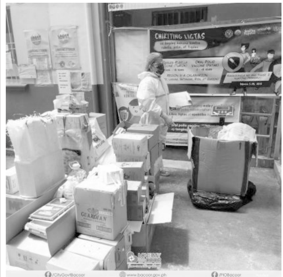
CityGovBacoor www.bacoor.gov.ph POCBacoor

Masinop na hinahakot ng mga kawani ng CENRO ang mga hazardous wastes mula sa iba't ibang health center. Kamakailan ay nagtungo sila sa Floraville – Panapaan I Health Center, Bacoor Government Center, at Southern Tagalog Regional Hospital.